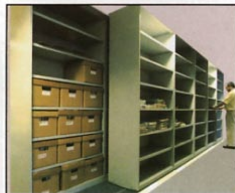
Glide-A-Slide is mounted in front of static shelving, on floor set tracks. Can be extended as required.