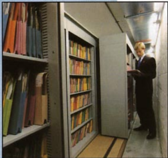
Glide-A-Slide in narrow corridor.