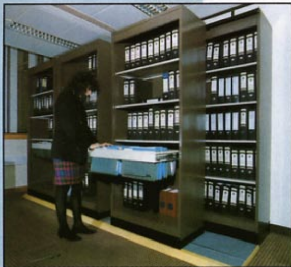
Awkward corners can be utilised with Glide-A-Slide shelving.